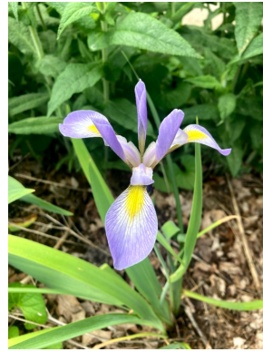
Blue Flag Iris